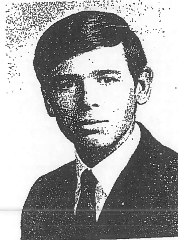
French delegate begins to question a fellow delegate on her Vietnam proposal.