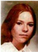
Facial/case ID Public viewable