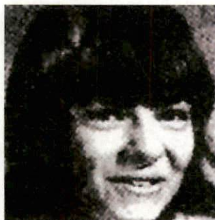
Above: Coon, circa 1970